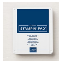
Night Of Navy Classic Stampin' Pad [147110] $7.50