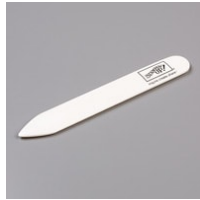
Bone Folder [102300] $7.00