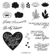
Always In My Heart Photopolymer Stamp Set [154337] $18.00