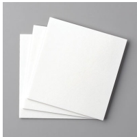
Foam Adhesive Sheets [152815] $8.00