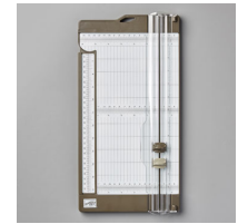
Paper Trimmer [152392] $25.00