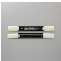
Soft Sea Foam Stampin' Blends Combo Pack [154902] $9.00