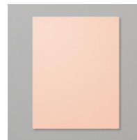
Petal Pink 8-1/2" X 11" Cardstock [146985] $8.75