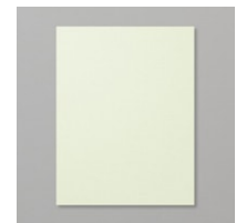
Soft Sea Foam 8-1/2" X 11" Cardstock [146988] $8.75