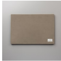
Stampin' Pierce Mat [126199] $5.00