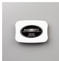
Tuxedo Black Memento Ink Pad [132708] $6.00