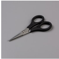
Paper Snips [103579] $10.00