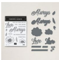
Forever And Always Bundle [156200] $45.75