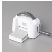
Mini Stampin' Cut & Emboss Machine [150673] $60.00