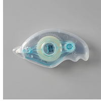
Stampin' Seal [152813] $8.00