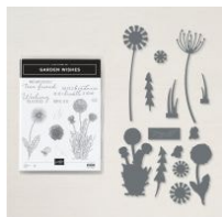
Garden Wishes Bundle