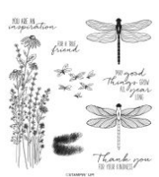
Dragonfly Garden Cling