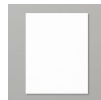
Basic White 8 1/2" X 11"