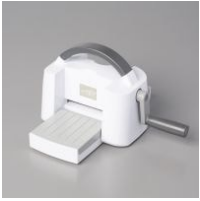
Mini Stampin' Cut & Emboss Machine [150673] $60.00