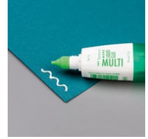
Multipurpose Liquid Glue [110755] $4.00