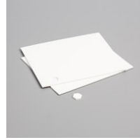
Stampin' Dimensionals [104430] $4.00