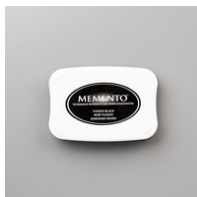
Tuxedo Black Memento Ink