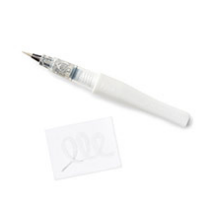
Clear Wink Of Stella Glitter