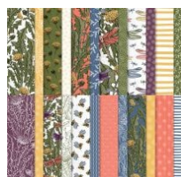
Dandy Garden 6" X 6" (15.2 X