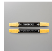
Daffodil Delight Stampin'