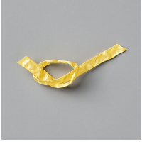
Daffodil Delight 1/4" (6.4 Mm) Ruched Ribbon [151311] $7.50