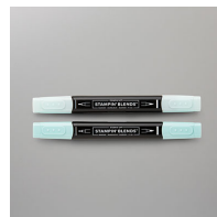
Pool Party Stampin' Blends