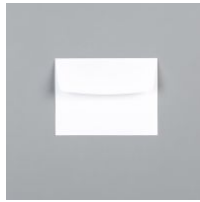
Basic White Medium Envelopes [159236] $7.50