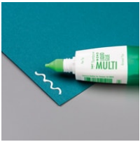
Multipurpose Liquid Glue [110755] $4.00