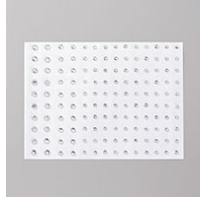
Rhinstone Basic Jewels [144220] $5.00