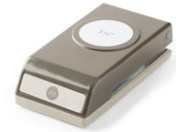
1-1/2" (3.8 Cm) Circle Punch