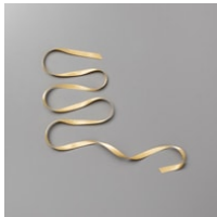
Gold 1/4" (6.4 Mm) Shimmer