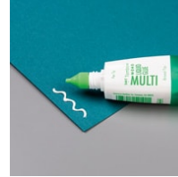
Multipurpose Liquid Glue