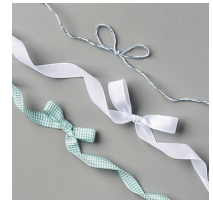
Flowers For Every Season