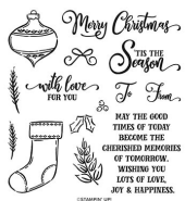
Tag Buffet Photopolymer