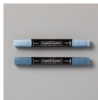
Misty Moonlight Stampin'