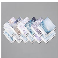
Feels Like Frost Specialty 6" X