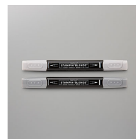
Smoky Slate Stampin' Blends