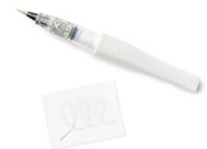
Clear Wink Of Stella Glitter