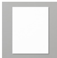
Whisper White 8-1/2" X 11"