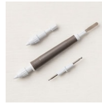
Take Your Pick