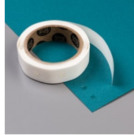
Mini Glue Dots