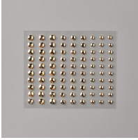
Gilded Gems [152478] $7.00