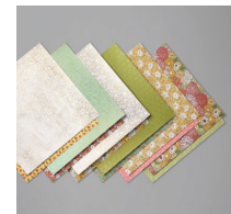
Ornate Garden Specialty