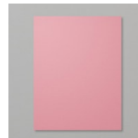
Rococo Rose 8-1/2" X 11"