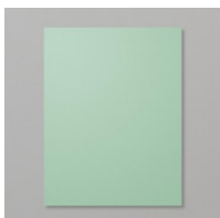
Mint Macaron 8-1/2" X 11"