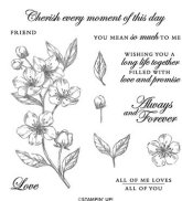
Forever Blossoms Cling