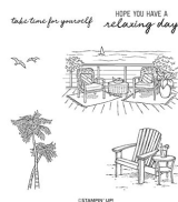
Seaside View Cling Stamp Set