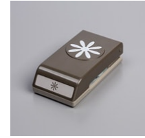
Medium Daisy Punch [149517] $16.00