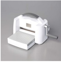
Stampin' Cut & Emboss Machine [149653] $120.00