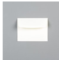
Very Vanilla Medium Envelopes