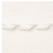
Whisper White 5/8" (1.6 Cm) Flax Ribbon