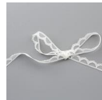
Very Vanilla 3/8" (1 Cm) Scalloped Lace Trim