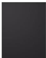
Basic Black 8-1/2" X 11" Cardstock [121045] $8.75