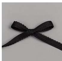
Basic Black 3/8" (1 Cm) Scalloped Edge Ribbon [150449] $8.00