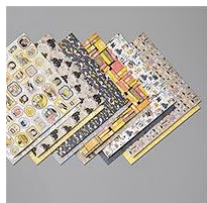
Monster Bash Designer Series Paper [150447] $11.50