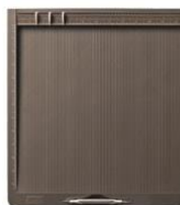
Simply Scored [122334] $30.00