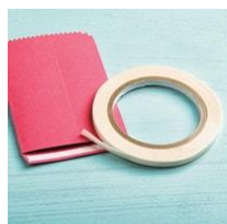
Tear & Tape Adhesive [138995] $7.00