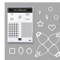
Tiny Keepsakes Bundle (En) [152390] $48.50