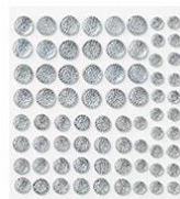
Clear Faceted Gems