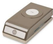
1-1/8" (2.9 Cm) Scallop Circle Punch