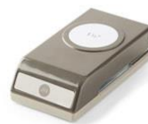
1-1/2" (3.8 Cm) Circle Punch [138299] $16.00