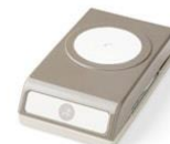
2" (5.1 Cm) Circle Punch [133782] $18.00